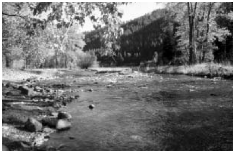
Natural spawning habitat for spring Chinook in the upper Salmon River.

Risks attributed to genetic changes also need to be scrutinized more carefully regarding the effects of artificial propagation. For