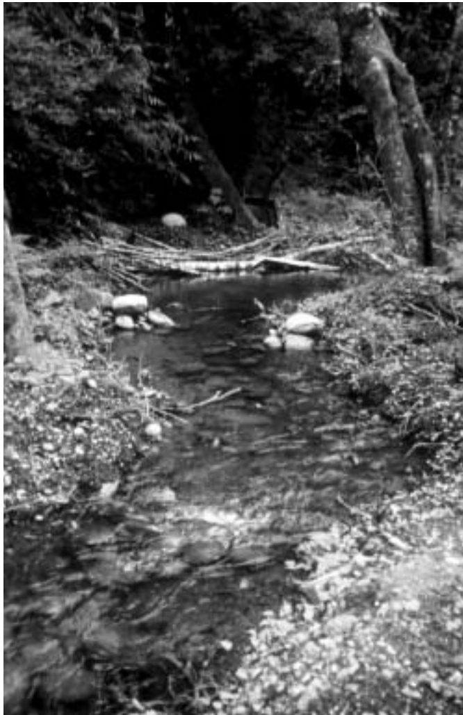
Engineered streams duplicate natural stream habitat, but increase production through managed flow, fish density control, and nutrient enhancements.

Other often-quoted studies demonstrating poor performance of hatchery fish are Chilcote et al. (1986) and Leider et al. (1990). These studies deserve attention because while they contribute to our knowledge about management scenarios, and their undertaking no doubt required extensive time and support, they are examples that show how careful one must be in interpreting the results. Skamania hatchery steelhead from the Washougal River have experienced strong selection for larger size and earlier timing since the 1950s, which moved their spawning earlier by as much as three months, and thus they were asynchronous even with their native Washougal steelhead, as well as with most other steelhead populations. These fish were transferred and released in the Kalama River for comparison with the Kalama steelhead under natural conditions, and they performed poorly. Among other shortcomings, most noteworthy were the severe spawn timing differences between the stocks, and the negative influence of the genetic marker (AGP-1 described as allele A') on fitness of the hatchery fish. The marker used to identify Skamania hatchery fish was alleged to result in a survival disadvantage (but see Campton et al. 1991). While these studies may be relevant infor-