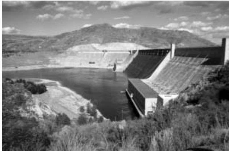
Grand Coulee Dam blocked 73,000 square miles of upper Columbia River Basin.

conditions, but in many cases the factors that permit their success, such as larger size at release, substitute for weaknesses in traits that are responsible for wild fish success, and may tend to misrepresent their comparative performance. The point that should not be missed in the above citations, however, is that these were fish from conventional hatchery programs, including translocation of stocks in some cases. Hatchery raised fish are naïve to circumstances in the natural environment