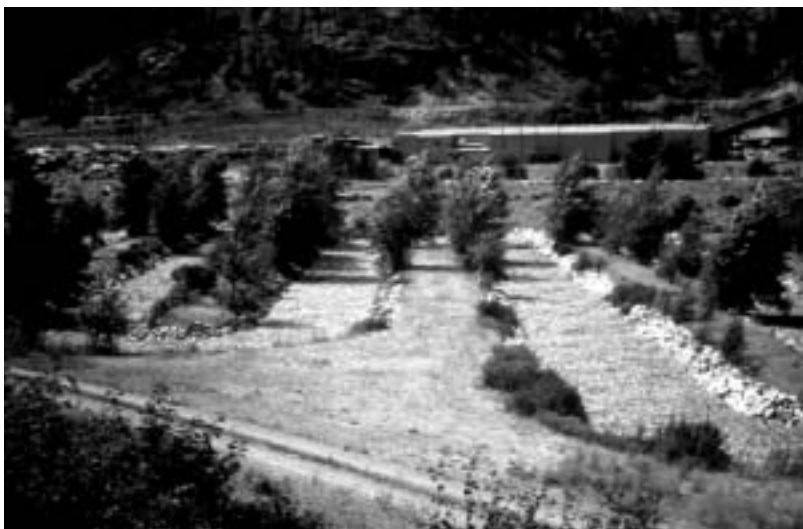
Pink salmon spawning channel on Seton Creek, British Columbia.

To clarify the culture option, it is important to provide a balanced assessment of artificial propagation, where both the risks and potential benefits are considered. With the major demographic changes occurring in the human population of Pacific Northwest, as noted by Lackey (2000), and the result-